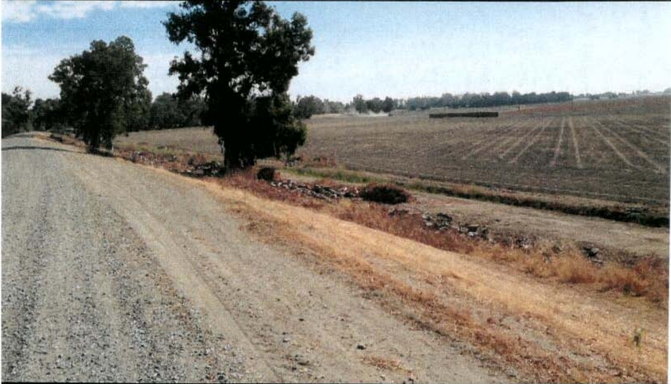
Cleared levee along the Sac River by Faye property August 2013