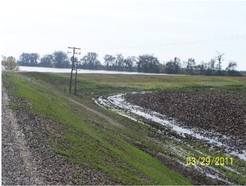
Levee Tow Road 1