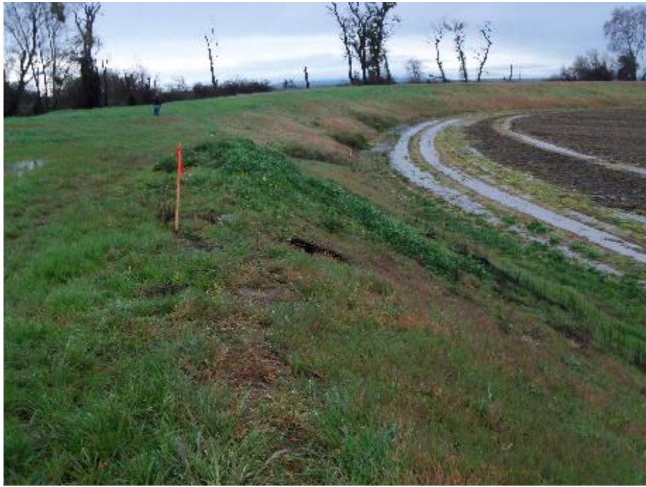
Missouri Bend 1