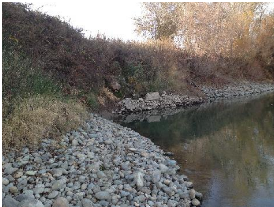
Channel Erosion 1