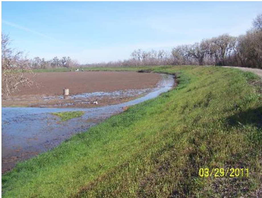
Perez Seepage 1