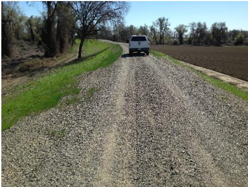
Cecil Lake Narrow Levee 1