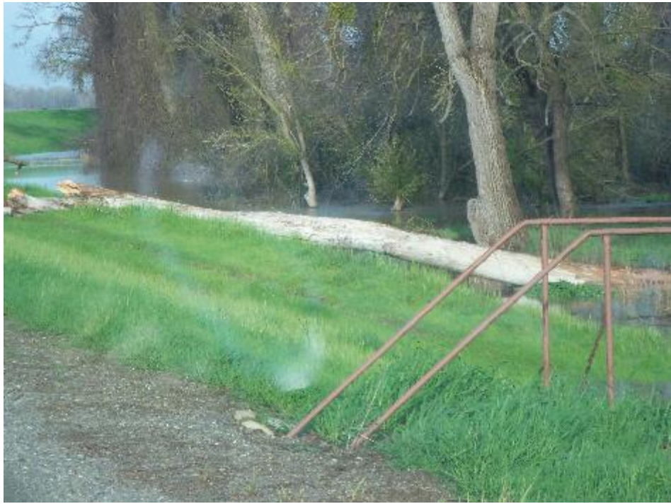
Cecil Lake Narrow Levee 2